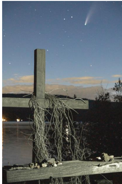
Love Divine, All loves Excelling by Charles Wesley Public Domain

1 Love divine, all loves excelling, joy of heav'n, to earth come down, fix in us thy humble dwelling, all thy faithful mercies crown. Jesus, thou art all compassion, pure, unbounded love thou art. Visit us with thy salvation; enter ev'ry trembling heart.