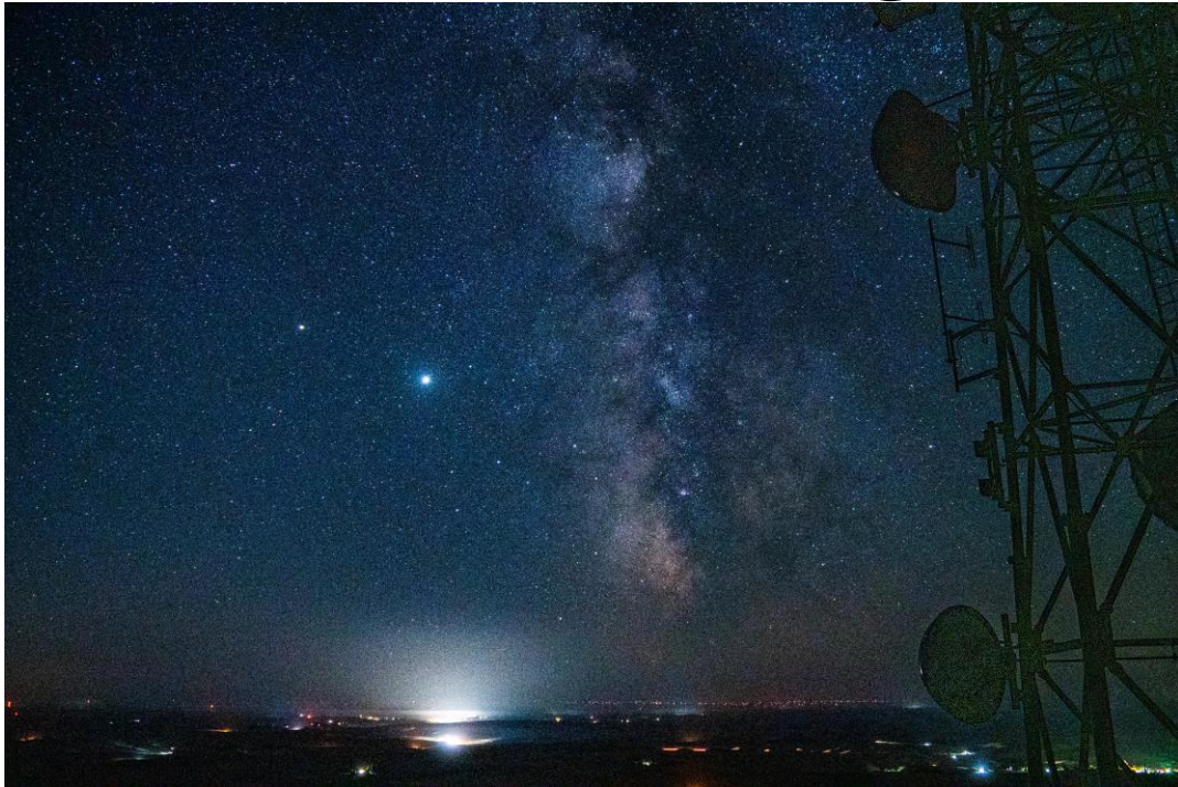
Image of Milky Way, Saturn, Jupiter, and a communications tower from the top of Steptoe Butte.