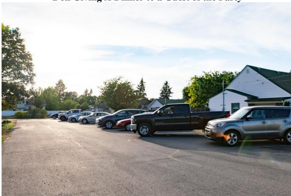
Guest Parked in the VUCC Lot Listening on Radio to Hana's Presentation/Program