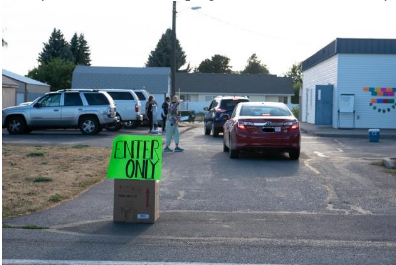
Welcome to 'Hana's Party at VUCC