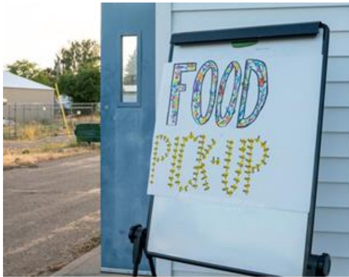
Dinner's Given To Party Guests In Their Cars