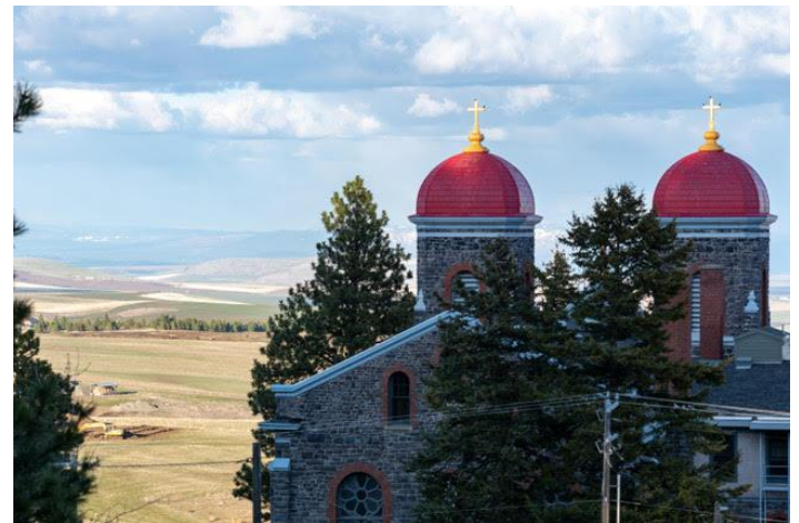
St. Gertrude's Monastery where I took images – Gen