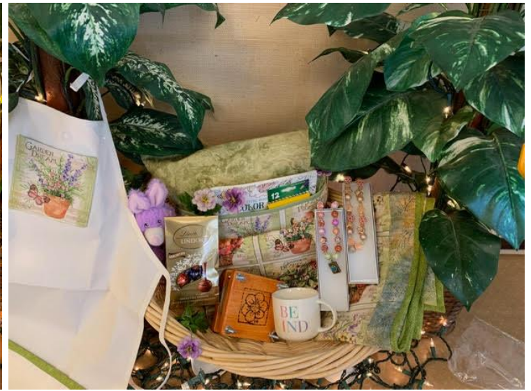
THREE MOTHER'S DAY RAFFLE BASKETS – WINNERS DRAWN ON MAY 9TH