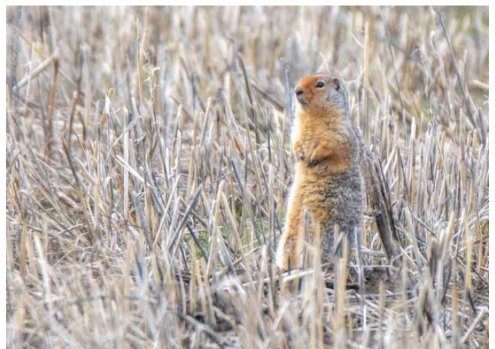
More Pictures by Gen Heywood while on vacation