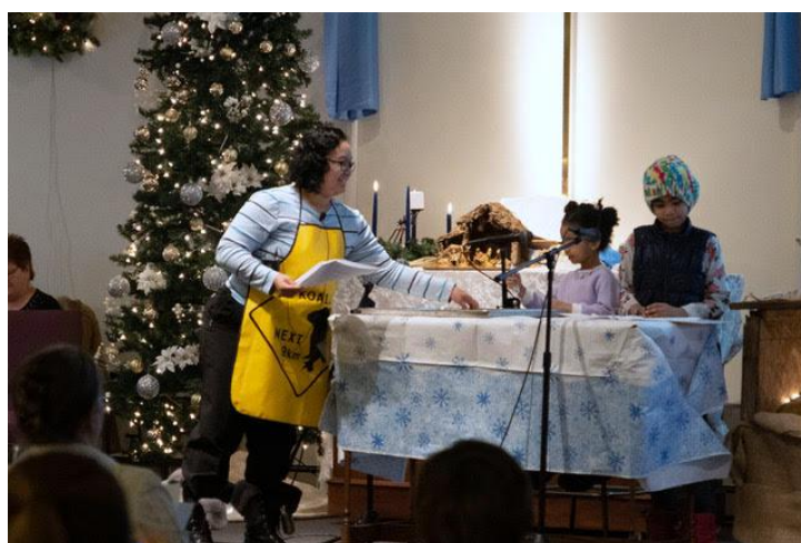
Christmas Play during Worship Service