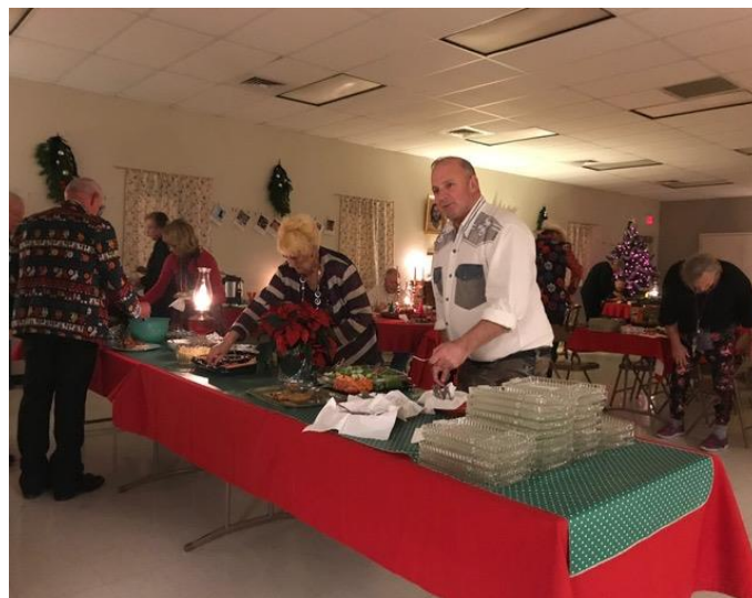
Enjoying Goodies at Plum Pudding