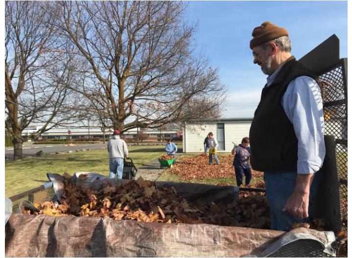
'Work Day' at VUCC Cleaning Church and Yard on November 2nd