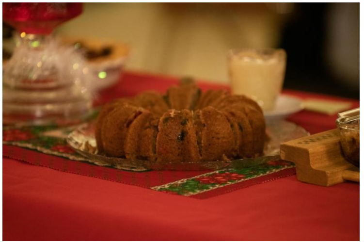
Plum Pudding – Goodies