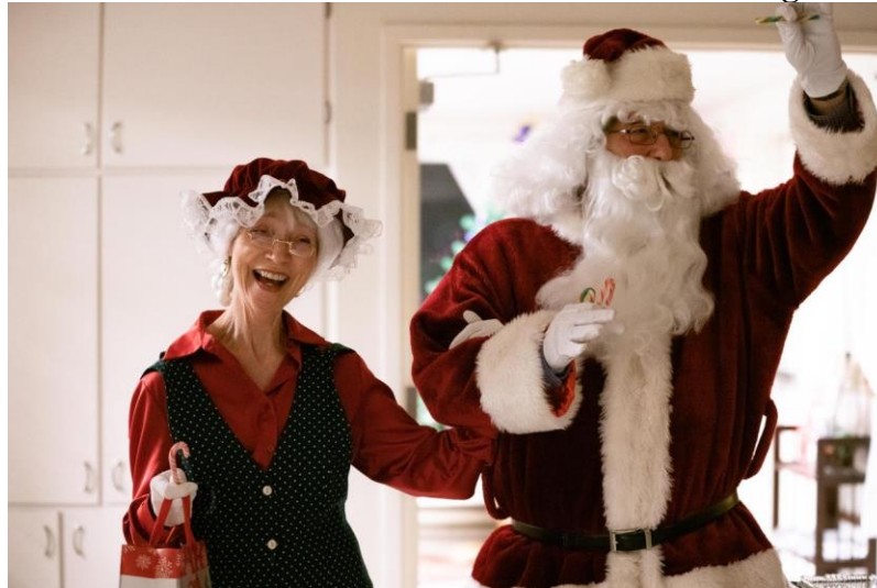
Plum Pudding – Santa & Mrs. Claus – Merry Christmas! December 22, 'Music Sunday' Choir and Bell Choir