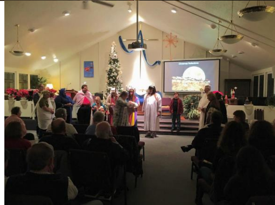
December 24, Nativity Play Cast