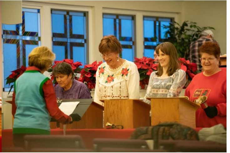
Plum Pudding – 'Bell Choir'